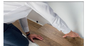
Figure 5: Slide plank 3 to your left until the short side is in contact with the short side of plank 1. Drop the short side of plank 3 onto the short side of plank 1 making sure that there is no gap between the short side of plank 1 and plank 3.