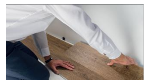
Figure 5: Slide plank 3 to your left until the short side is in contact with the short side of plank 1. Drop the short side of plank 3 onto the short side of plank 1 making sure that there is no gap between the short side of plank 1 and plank 3.

Figure 4: Working from the wall, insert plank 3 into the long side of plank 2.