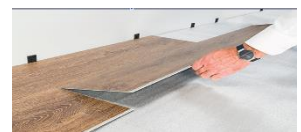
Figure 7: Continue alternating planks on rows 1 and 2. Ensure planks are properly aligned along the chalk line and against the spacers. Finish rows 1 and 2 in this manner, cutting planks at the end of the row, as necessary. Ensure that the end planks are a minimum of 6" (150 mm) in length. If necessary, adjust the length of starter pieces to insure minimum plank lengths for each row, with proper end joint stagger row to row.

Figure 6: Using a rubber mallet, lightly tap the joint on the short side to engage the locking system.