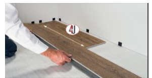
Figure 4: Working from the wall, insert plank 3 into the long side of plank 2.

Figure 3: Use a full-length board for Plank 2 which will be installed in the second row. Align plank 2 at an angle, onto the long side of plank 1 making sure there are no gaps. Drop plank 2 to lock in place.