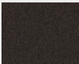
649 Coffee Bean