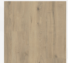
Citizen BRLT84L630VL (Moderate Shade Variation)