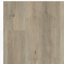
Devotion LFR2284EIR (Moderate Shade Variation)