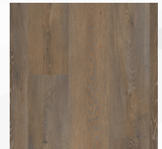
Tribute LFR7184OVL (Moderate Shade Variation)

Samples are intended to be a reference for product visuals and may not represent all color, shade, pattern, and texture variations. Actual product may differ from small swatches, printed media, or digital computer images. Our premium laminate flooring is waterproof from top-bottom moisture for up to 72 hours!