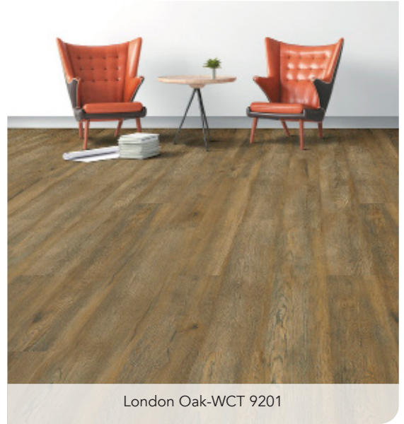
London Oak-WCT 9201