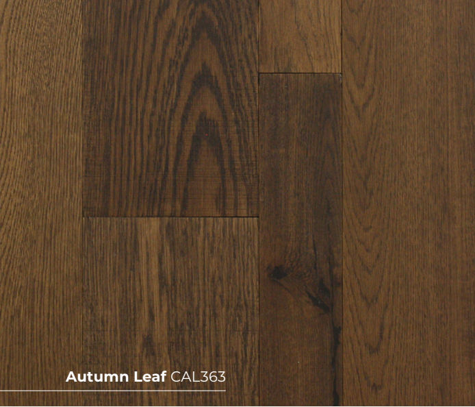
Autumn Leaf CAL363